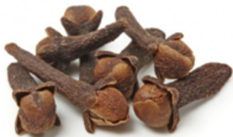
Fig. 4: Syzygium aromaticum (Clove) 45