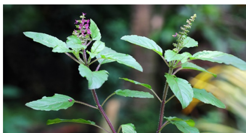
Fig. 1: Ocimum sanctum (Tulsi) 45

As per previously conducted study, the essential oils of the many leaves of like Cymbopogon nardus (Citronella), Cymbopogon citratus (Lemongrass), Ocimum basilicum (Sweet Basil), Ocimum sanctum (Tulsi), Ocimum americanum (Hairy Basil), Eucalyptus citriodora (Eucalyptus), Eucalyptus globulus (Eucalyptus), Curcuma longa (Turmeric) rhizomes, Citrus sinensis (Sweet Orange) peels, Citrus limonum (Lemon) peels, Syzygium aromaticum (Clove) buds and Pinus roxburghii resins have shown effective mosquito repellent action. The extracts of Azadirachta indica (Neem) seeds has the property of mosquito repellents as well as helps in cleaning the atmosphere. 44