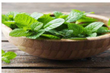
Fig. 5: Mentha piperita (peppermint leaf) 45