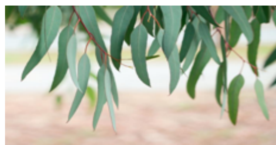
Fig. 3: Eucalyptus globules (Eucalyptus leaf) 45