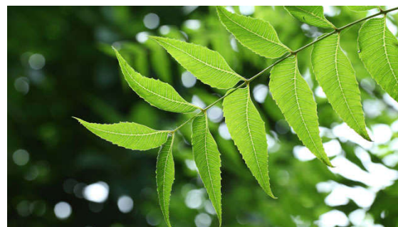
Fig. 2: Azadirachta indica (Neem) 45