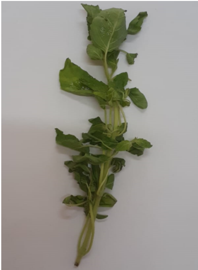
Figure 1: Image of ordinary Tulsi leaf.