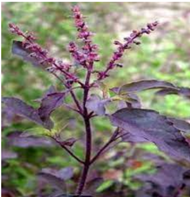
Figure 2: Image of krishna/black Tulsi leaf.