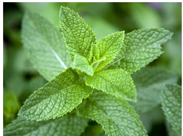
Figure 4: Mint/pudina leaf.