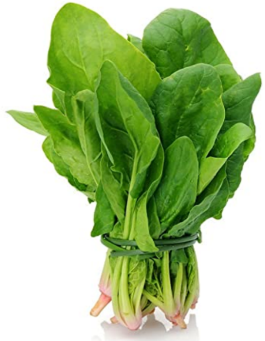
Figure 3: Spinach leaf.