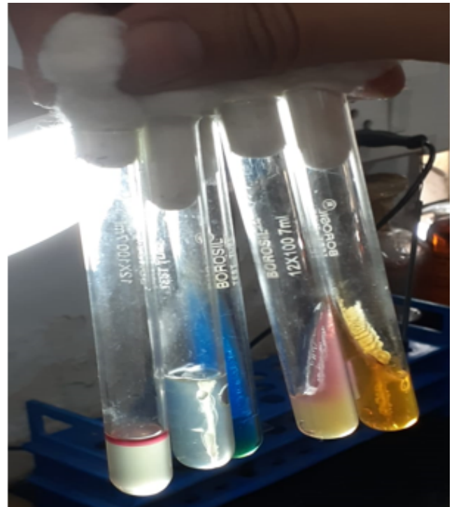
Figure 7: Biochemical reactions of Klebsiella oxytoca from Spinach