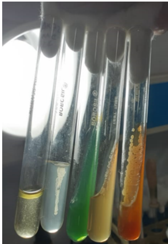
Figure 6: Biochemical reactions of Escherichia coli (Indole Negative) from Tulsi